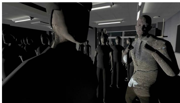
Figure 3. – A still from Sleeping Eyes

Anonymous is an interactive 3D real-time rendered cinematic VR applying gaze interaction. The story concerns the life of an old man living alone and remembering his life. The main character and his environment are abstracted by using cardboard textures. The viewer is able to access the perspective of objects that fill this domestic setting, ultimately finding themselves assuming the role of the man's dead wife, where from the vantage of her portrait hung on the wall, they observe the rituals of his solitary daily life.