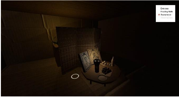
Figure 6. – The gallery room for Anonymous

This second space is treated in a far less literal than the first. Our design intention was to defamiliarise the viewer by transitioning from a space that resembles a conventional art gallery to a small room made from cardboard. Finding themselves in this enclosure breaks the viewer's expectations. By evoking spatial estrangement [11], we hoped to instill a sense of curiosity that encourages them to explore the virtual space more actively and imaginatively. For starters, the lining of the walls, floor and ceiling appear to be made from a cardboard box. A small shrine is placed in the middle of the room.