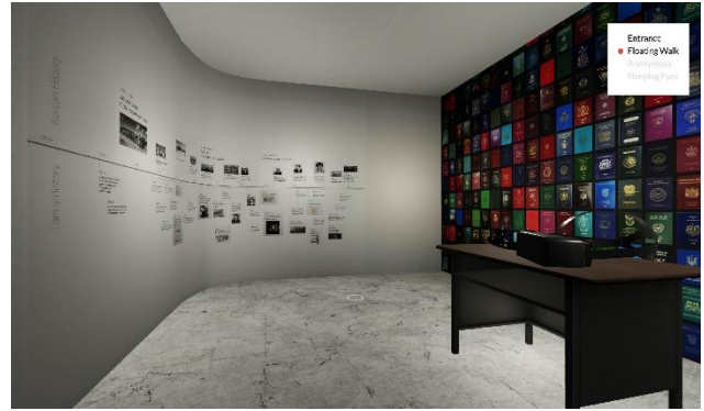
Figure 5. – The room of Floating Walk with the headset visible on the table.

Upon first entering the exhibition, the viewer finds themselves in an anteroom where they are provided with an introductory explanation about the exhibition and its inventory of artworks in the form of a didactic panel. Each artwork is installed in a dedicated gallery, providing the viewer with access to renditions of the VR films (either 360° video or play-through) along with representative images, digital objects and textual descriptions related to the individual project.