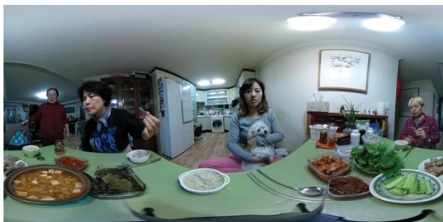
Figure 1. – A still from Floating Walk

The inventory of the examination exhibition was comprised of three VR projects produced by Bahng between 2016-2020: Floating Walk (360° video), Anonymous (interactive mobile VR) and Sleeping Eyes (interactive navigable VR). Each project was conceived as a means of exploring the communicative potential of cinematic VR in response to themes of personal and societal alienation, disconnection and isolation. The socio-cultural issues focused upon in these creative works prompt the audience to engage in critical self-reflection and to reconsider how they connect empathetically with others. More specifically, the subject of these projects engaged with immigrant identity ( Floating Walk ), no-relationship society ( Anonymous ), narcolepsy and social ignorance ( Sleeping Eyes ). Brief synopses of each work follow.