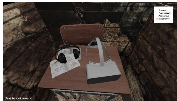
Figure 7. – The view from up in the watchtower for Sleeping Eyes ; The HMD and headphones can be seen on Sungeun's desk.

Returning to Sleeping Eyes : When the viewer approaches the watchtower in its reconstructed digital form in the virtual exhibition, they are invited to ascend a ladder. Upon reaching the top, they alight onto a small, restrictive platform containing a classroom desk where a set of drawings created by the film's protagonist (the artist, Sungeun Lee) are scattered across its surface, along with an HMD that invites activation of a 2D play-through video of the VR film.