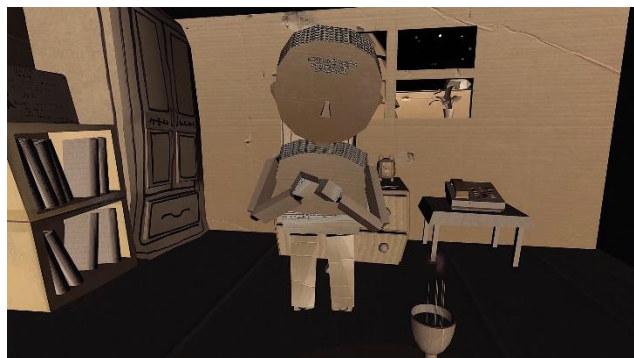
Figure 2. – A still from Anonymous

Floating Walk – Gangnam Kangaroo is a 360° autobiographical documentary of a Korean woman living in Australia. She goes on a journey of self-confrontation to the root of her unclear but painful emotion and discovers that historical traumas have affected her identity. A spatial collage of 360° video images represents the artist's journey in Australia and Korea.